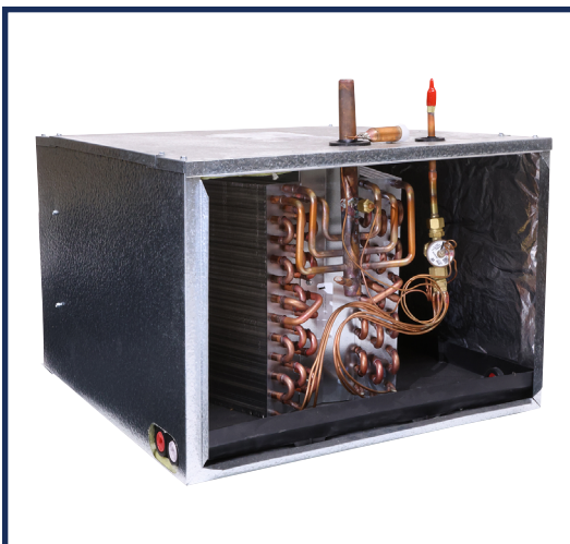
Unit shown with service panels removed. Representative image only. Some models may vary in appearance.