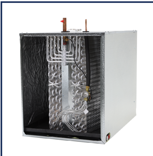
Unit shown with service panels removed. Representative image only. Some models may vary in appearance.